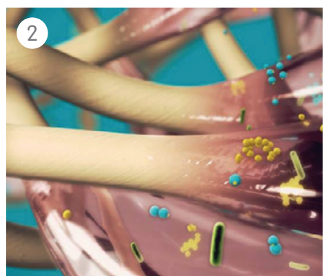
Forming a gel upon contact with exudate<sup>3</sup>